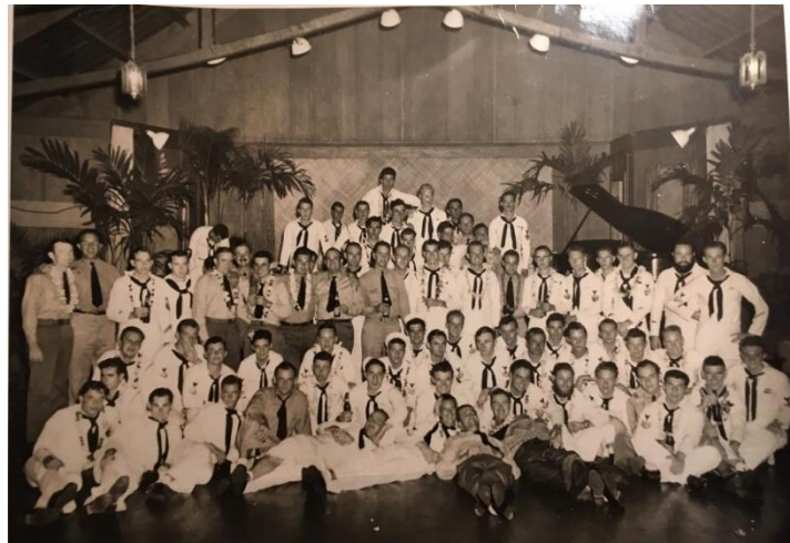
USS Albacore SS218 October 1944